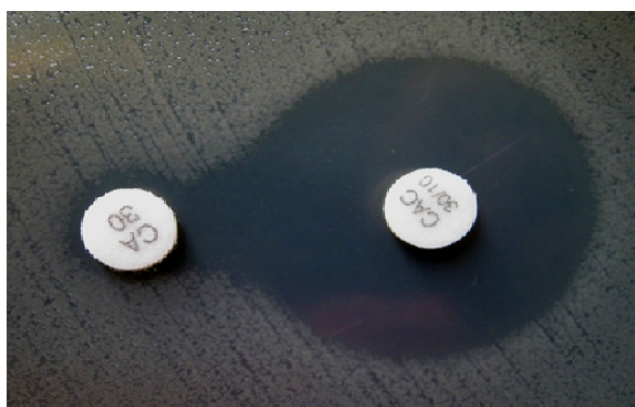
Figure 2: Positive phenotypic confirmatory disk diffusion test by CLSI for ESBL showing \geq 5 mm increase in zone diameter of ceftazidime (CA) in the presence of inhibitor clavulanic acid (CAC), synergism is also seen between these two antibiotics.

Out of these 48, ESBL production was detected in 41 isolates by Phenotypic confirmatory disk diffusion method. So the prevalence of ESBL producing Klebsiella pneumoniae in our Neonatal ICU was 75.92% (41/54).